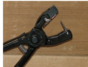
Tagger in "open" position with pin vertical

Sorry. We had several complaints during our first spring (2006) with the Temple tag. Most of those centered on the tagger. Temple identified two design flaws, issued a recall and replaced hundreds of taggers. There was also a learning curve with the Temple tagger when compared to the more familiar, "Z-tagger". While both offered "break-away" pins, the Temple tagger's break away mechanism operated while the tagger's handles were closed together. Releasing the handle locked the pin. This was different than the more familiar Z-tagger where releasing the handle also released the pin. Since the fall of 2006, people happy with the new tag are running even with folks who miss the one piece tag. Complaints about the tagger have stopped altogether.