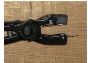
Tagger in "shut" position with pin "broken away"

We still have people that do not order a tagger because they want to try their old (insert brand name here) tagger before they commit to spending the $20 for a new Temple tagger. They always end up coming back for a Temple tagger; so you can save yourself a few headaches and get it all at once. However, if you still want to give your old one a try....we always enjoy talking to our customers, so we won't mind the extra phone call.