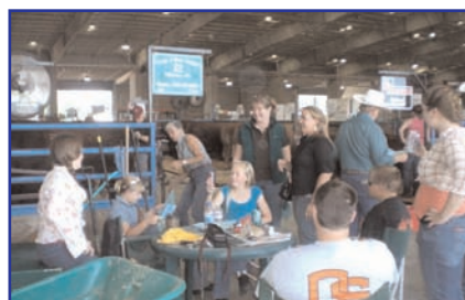
Northwest Juniors at Oregon State