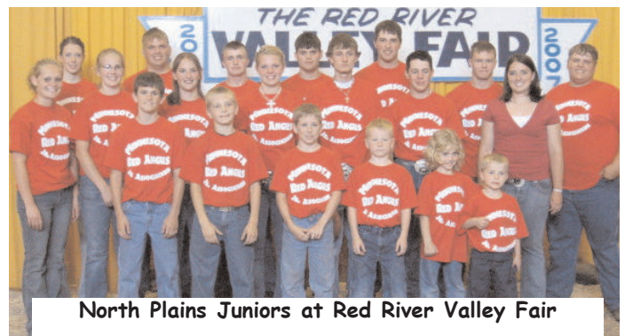
North Plains Juniors at Red River Valley Fair