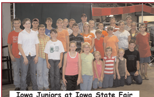
Iowa Juniors at Iowa State Fair