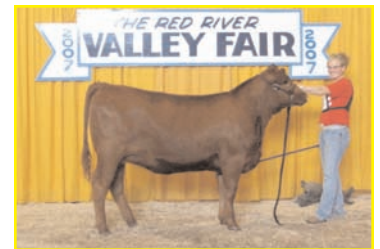
Ch Red Angus Red River Valley Fair Exhibited by: Lindsey Frey